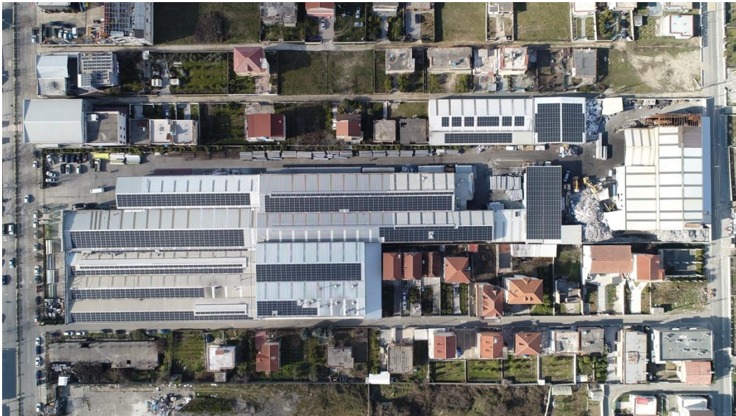
Figure 3. Photovoltaic panels on the terrace of the metallurgical sector, “Everest” ltd company [16]

This energy demand is not enough to cover all the request of the energy that is needed for aluminium production. The future research work would reveal if it is possibility in any energy crises to implement a wind energy farm for supporting the energy demand that is requested in aluminium production.